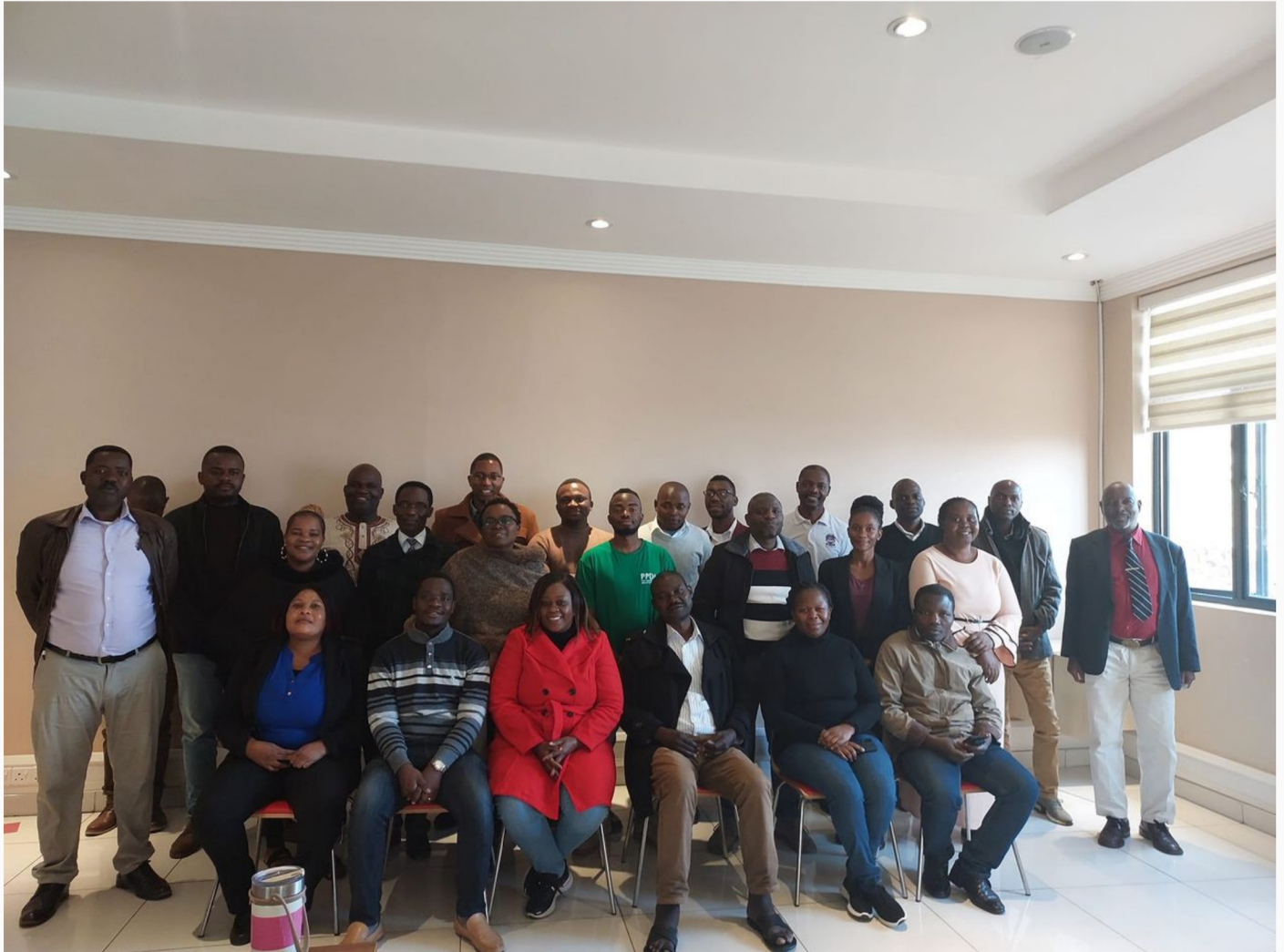
PPDA Staff pose for a group photo after the training at Chikho Hotel, in Mponela.

On 13 July 2023, PPDA took a great milestone in staff development by organizing a comprehensive orientation program for staff in general government business. The training facilitated by the Malawi School of Government (Mpemba Campus) aimed to equip the staff with essential tools and techniques to navigate the intricacies of government business, ultimately bolstering the efficiency and effectiveness of public procurement processes in the country.