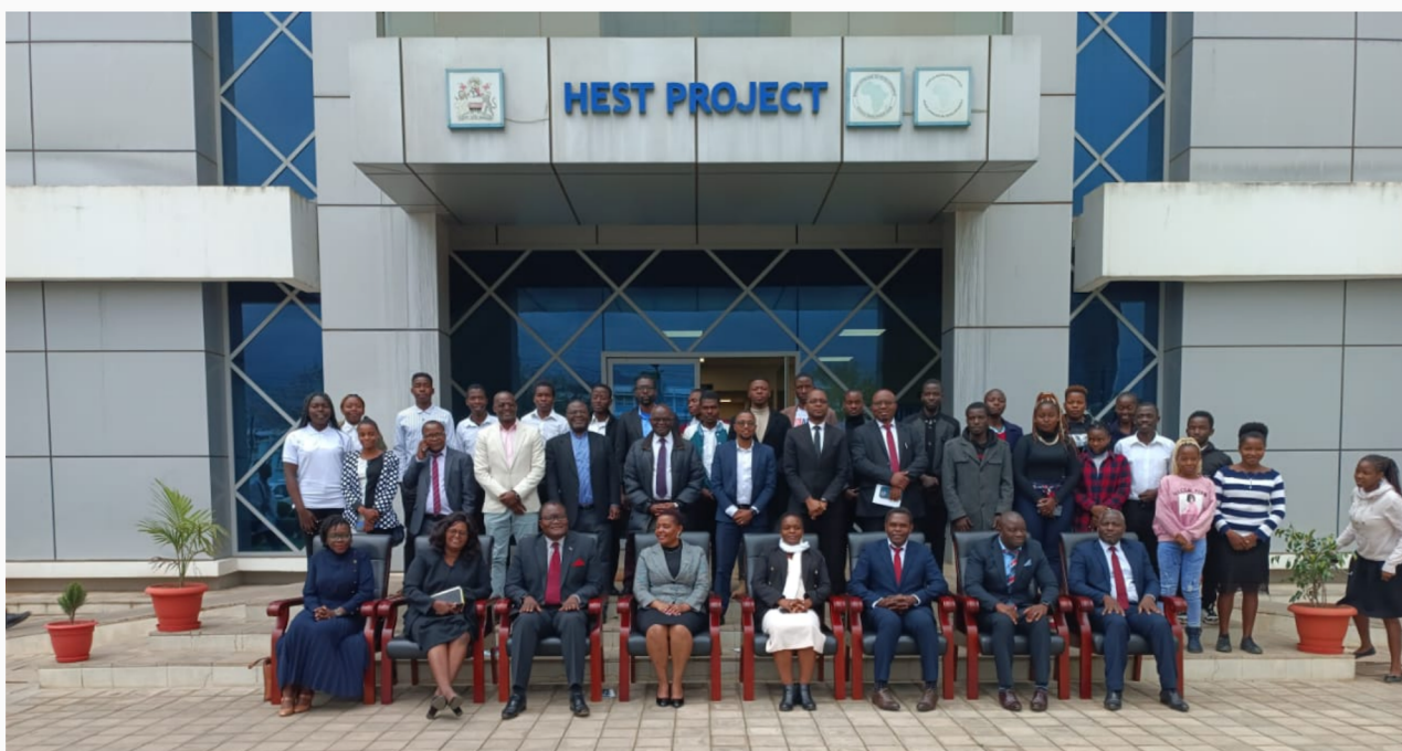
A group photo: PPDA staff, MUBAS Faculty members and Students after the official book donation handover ceremony.